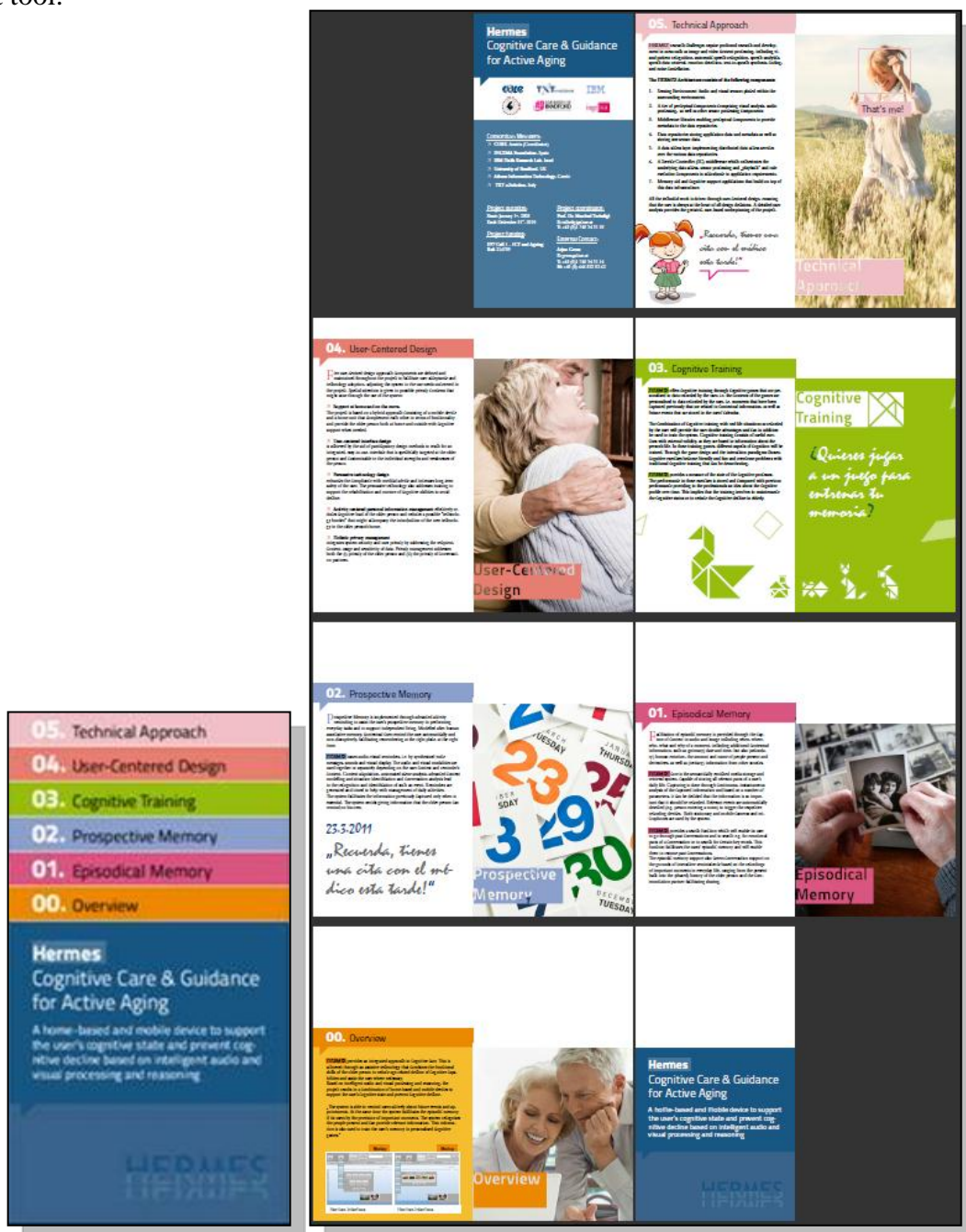
Figure 4: HERMES Brochure

The project brochure is the more detailed, glossy version of the former project leaflet that has not been used anymore in 2010 respectively 2011. It is more sophisticated in the print and presents the consortium in a more beautiful manner at the various events. In the brochure more space can be devoted to the individual components as well as their integration. The brochure was passed out at the various events where HERMES had been presented like the ICT2010 in Brussels or the AAL Forum 2010 in Odense. All attended events of the last project year are listed in D9.3c. The brochure was used as give-away for the visitors of these events and therefore contained all important information about HERMES and its approach as a memory support tool.